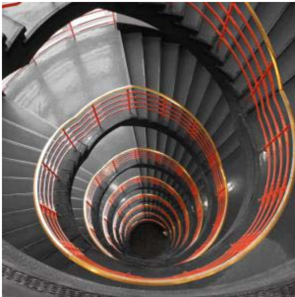
golden spiral golden triangle